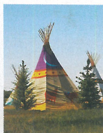
A 300-square-foot luxury tepee at Mustang Monument in Nevada.

The year the keyword glamping started to gain traction, according to Google Trends.