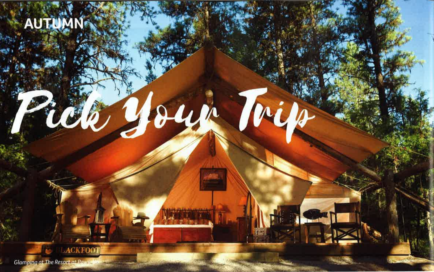
Glamping at The Resort at Paws Up