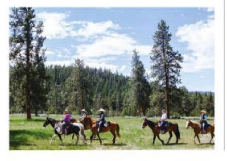
92 MEN'S BOOK | FALL 2017

I step forward to the enormous carving board for a refill, sneaking a glance at the unsliced hunk. It doesn't look special. It just tastes amazing. And this is what the guy achieves when he's not on his home turf. I decide I don't