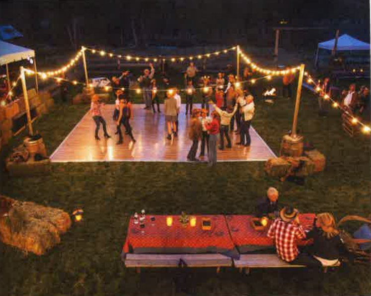
THE RANCH AT ROCK CREEK