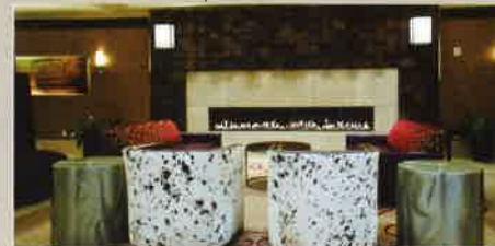
THE NORTHERN HOTEL, BILLINGS

into the wilderness, fun chuckwagon barbeques along the river and sleigh rides leading to a bonfire and tasty treats.