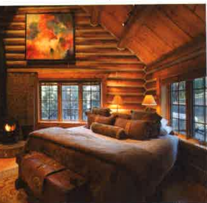
TRIPLE CREEK RANCH