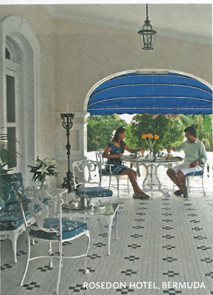
ROSEDON HOTEL, BERMUDA

In this region, steep mountainsides bottom out into mirror lakes, and valleys flower with frothy beargrass and bright red Indian paintbrush in the spring. But far from just a looker,