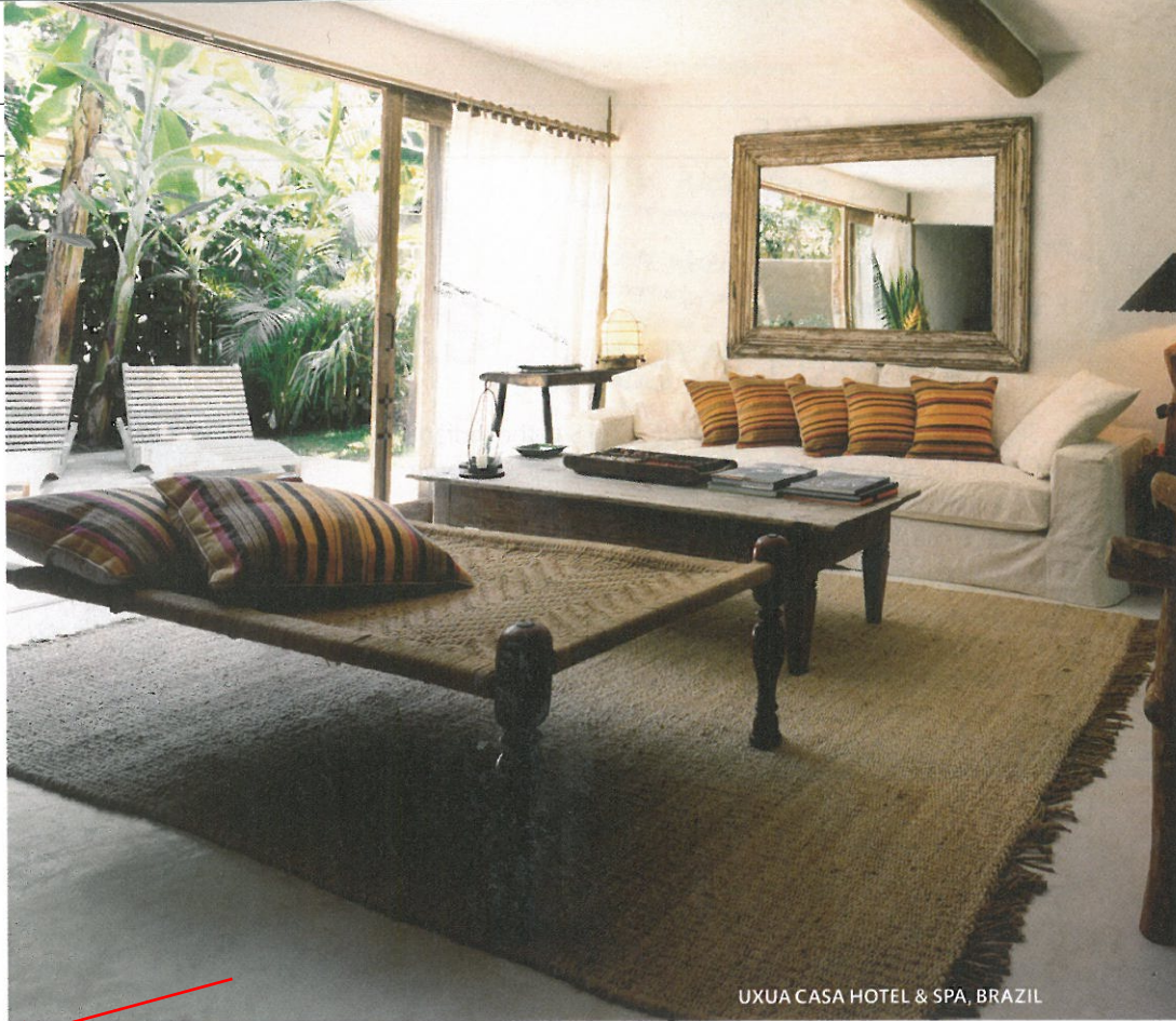
UXUA CASA HOTEL & SPA, BRAZIL

Montana has unparalleled hiking, tubing, and critter-spotting (elk, bison, and bears, oh my!).