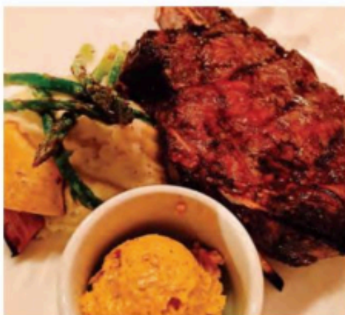
Dry Aged Bison Ribeye with Yukon smashed potatoes, asparagus, sundried tomato compound butter at Pompl

Julie picks us up after a wonderful breakfast delivering us to another part of