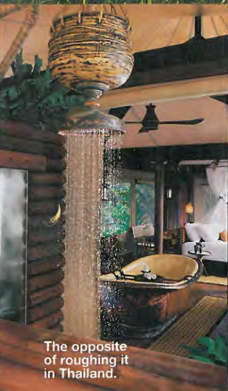
The opposite of roughing it in Thailand.

Arrival to the Four Seasons Tented Camp Golden Triangle is a thrill itself with a ride past villages and rice paddies.