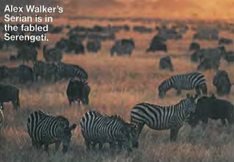
Alex Walker's Serian is in the fabled Serengeti.

workout, which includes a hike, run and weights session. Or just hang out by the freeform riverside pool, grab a cocktail in the panoramic Burma Bar and enjoy a Thai herbal massage in the spa tent.