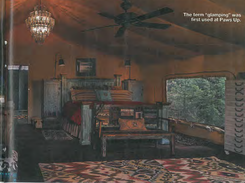
The term "glamping" was first used at Paws Up.

chic furnishings, indoor and outdoor showers, private plunge pools and decks overlooking the gorge. There are no phones, but each tent has a walkie if you need to contact the staff. WiFi is available in the main tent, which also houses a living room, the bar, a library and seating for meals.