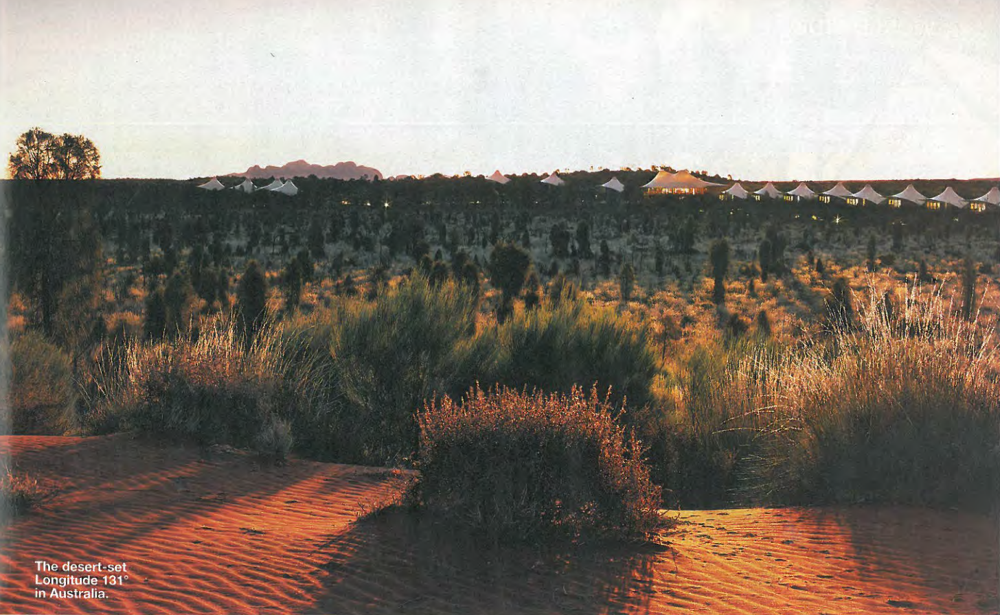
The desert-set Longitude 131° in Australia.

T here's something inherently romantic about sleeping under the stars . The sounds, the setting, the vast, carpeted sky. But camping can also bring tinned food, sketchy public restrooms and a major bug factor. Thankfully there is a host of high-end properties around the world that offer all the adventure to set your heart aflutter and all the pampering to make your honeymoon dreams come true. From Australia to Zimbabwe, here's a list of our favorite spots that offer the opportunity to reconnect with nature —without sacrificing upscale amenities (think oversized copper bathtubs) and service (like a “camping butler” to set-up s'mores roasts). →