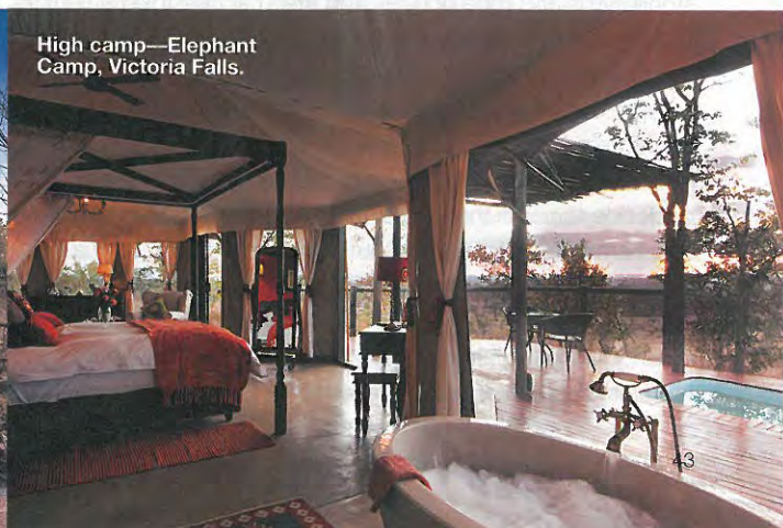
High camp—Elephant Camp, Victoria Falls.