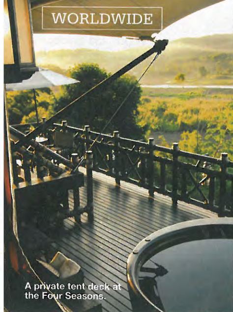
A private tent deck at the Four Seasons.