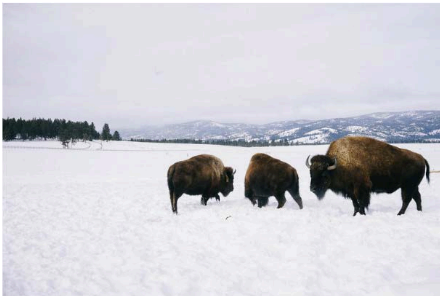
The resident bison at the ranch.

As we made the drive from Missoula, Montana, the scenic mountains towered over us. Expansive valleys and snow-topped trees held promise for the road we were turning off to — a large sign saying "The Resort at Paws Up." Arriving onto the 37,000-acre ranch in the Blackfoot Valley, we were greeted in a rustic luxurious building. A bit of this and that, and we were handed the keys to what would be an unforgettable winter Montana adventure.