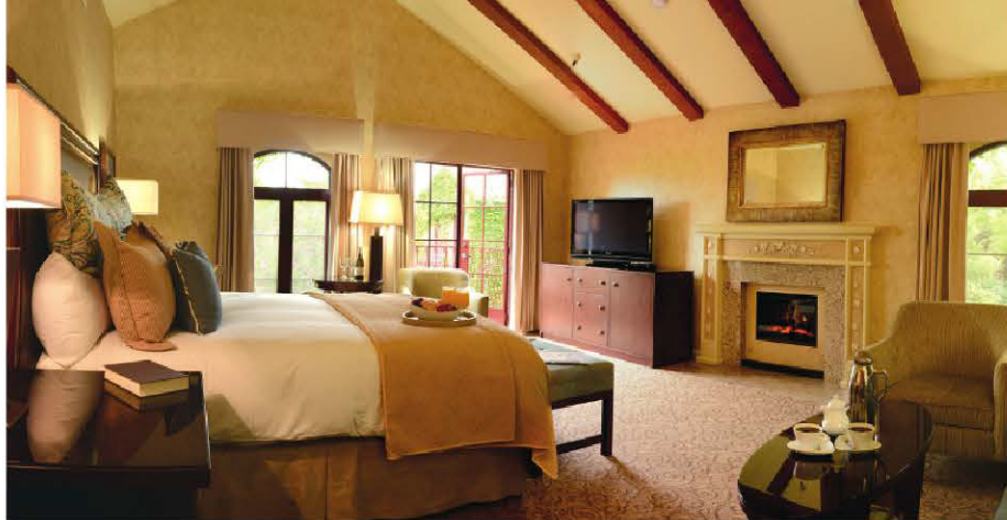
FROM PAGE 23

cuisine varies seasonally and may include Black Angus and bison steaks, elk, rainbow trout, organic salads and local huckleberries.