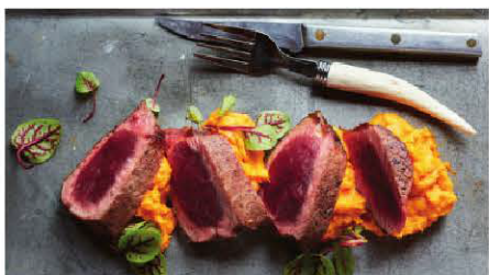
» A fireplace room at Vintners Inn, top. Roasted elk short loin, above, from a Montana farm, served with yam puree at The Resort at Paws Up.

Vintners Inn ( vintnersinn.com ): Described as “a destination that defines serenity,” the inn is located among 92 acres of vine-