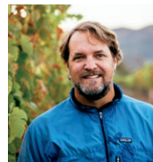
Chad Melville Melville Winery Lompoc, CA