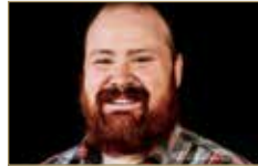
Chef Kevin Gillespie Gunshow / Revival Atlanta, GA / Decatur, GA