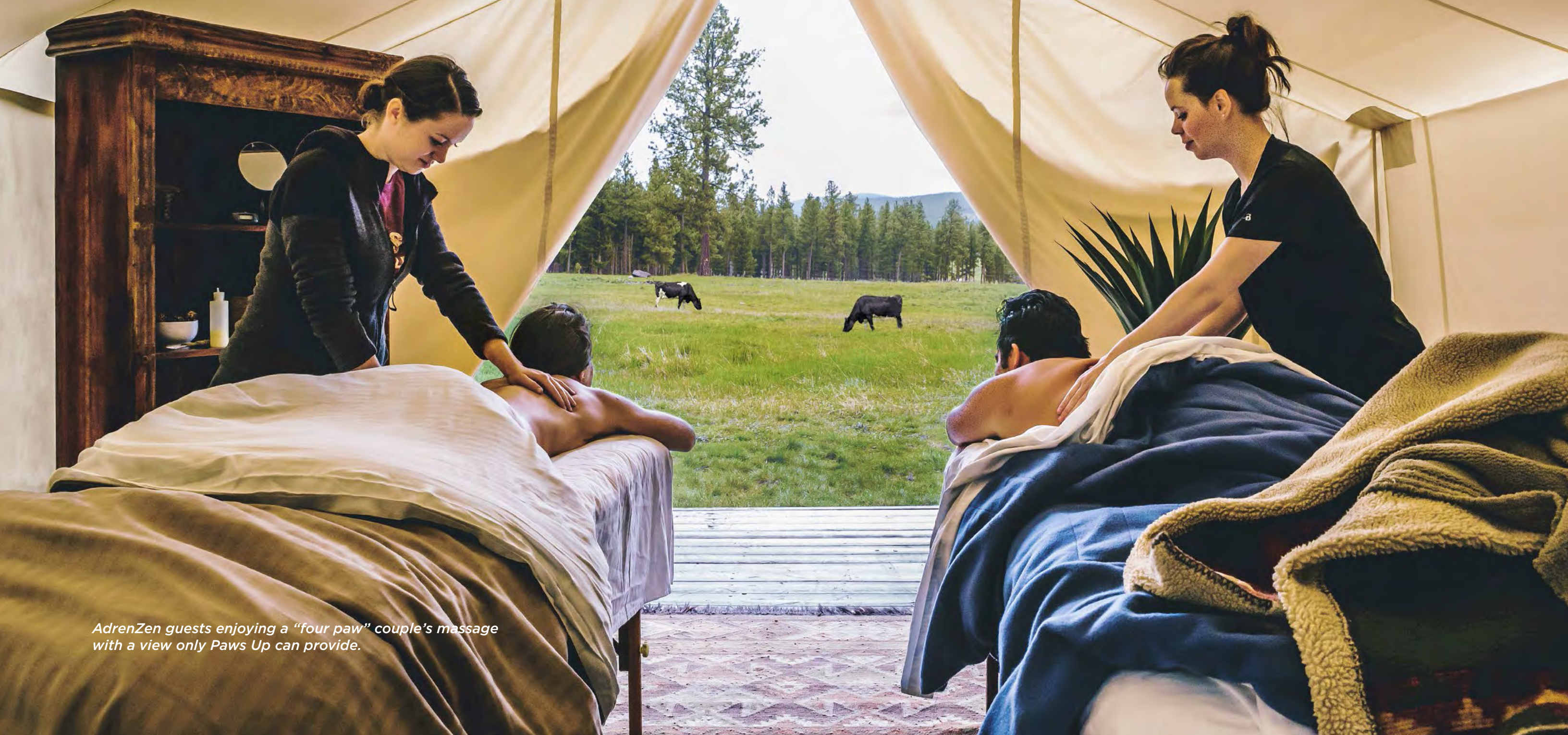
AdrenZen guests enjoying a “four paw” couple’s massage with a view only Paws Up can provide.