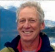
GEORGE VAN HOOK Artist in Residency

From shimmering peaks to foam-flecked rapids, the natural beauty surrounding Paws Up inspires awe. So will learning to capture it with guest artist George Van Hook. He'll conduct this popular "plein air" watercolor workshop in a variety of eye-popping settings. It's an unforgettable way to learn from a true pro and preserve a segment of Montana's stunning scenery for your mantle.