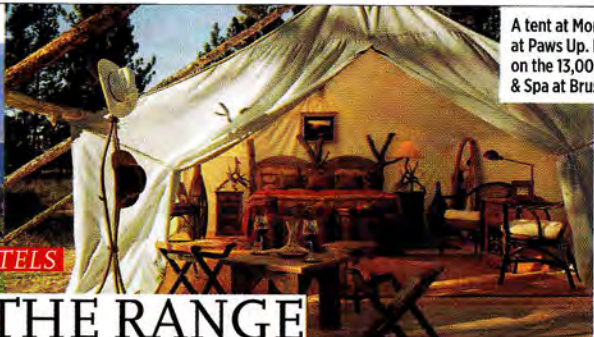
A tent at Montana's Resort at Paws Up. Left: Wild horses on the 13,000-acre Lodge & Spa at Brush Creek Ranch.