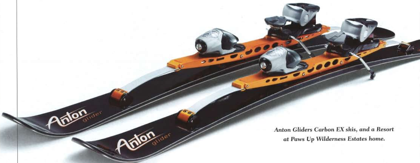
Anton Gliders Carbon EX skis, and a Resort at Paws Up Wilderness Estates home.

Skiing as a contact sport, and a green retreat in Greenough. . . .