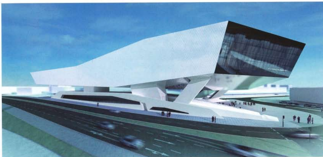
A rendering of the Porsche Museum in Stuttgart, Germany (above), the IW Club at the Indian Wells Golf Resort (below left), and the Vogard 18kt Gold Edition world-time watch.

Porsche's place in history, and a watch with a precise sense of place.