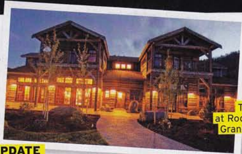
The Ranch at Rock Creek's Granite Lodge.