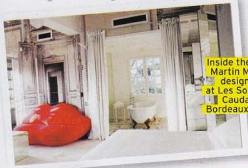
Inside the Maison Martin Margiela-designed suite at Les Sources de Caudalie, near Bordeaux, France.

FRANCE To mark its 10th anniversary, the renowned French hotel and spa Les Sources de Caudalie (Bordeaux-Martillac; 33-5/57-83-83-83; sources-caudalie.com ; doubles from $290) commissioned the avant-garde fashion house Maison Martin Margiela to revamp its stand-alone suite, a favorite with local residents. Black-and-white photographs cover the walls, and white curtains are draped over cowskin floor mats. A lips-shaped sofa by Gufram adds a shot of color, but the best seat is still the terrace lounge for watching the resident peacocks. —TINA ISAAC